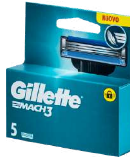
GILLETTE Mach 3 patrone 5/1 [10kom/karton] BC:8001090922120