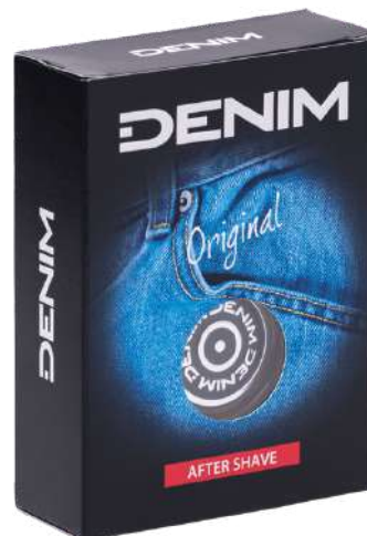
DENIM losion posl. brijanja Original 100 ml [12kom/karton] BC:8008970004051