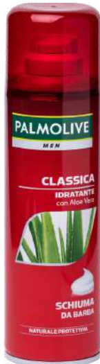
Palmolive pjena za brijanje Classic aloa vera 300 ml [12kom/karton] BC:8718951540675