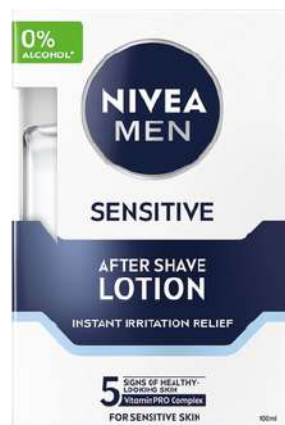
Nivea SENSITIVE Losion za njegu osjetljive kože nakon brijanja 100 ml 81314 [24kom/karton] BC:4005808588763