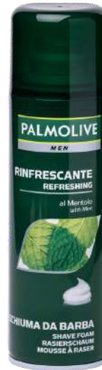
Palmolive pjena za brijanje Mentol 300 ml [12kom/karton] BC:8718951540644