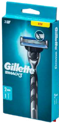
GILLETTE Mach 3 Brijač [8kom/karton] BC:8700216480109